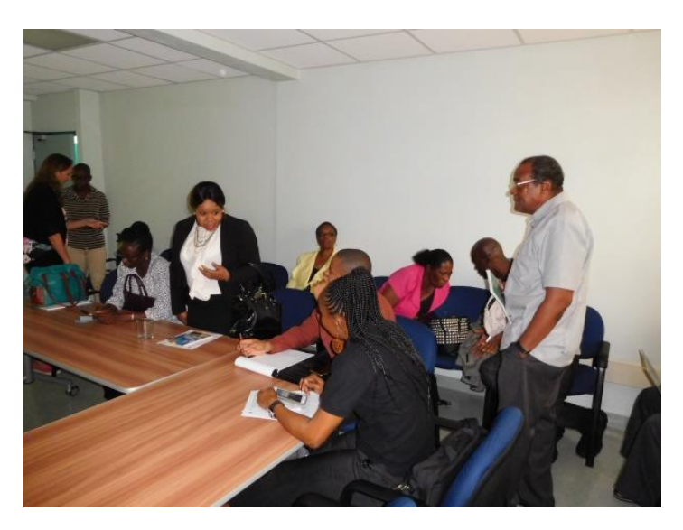
(1) During the workshop 1