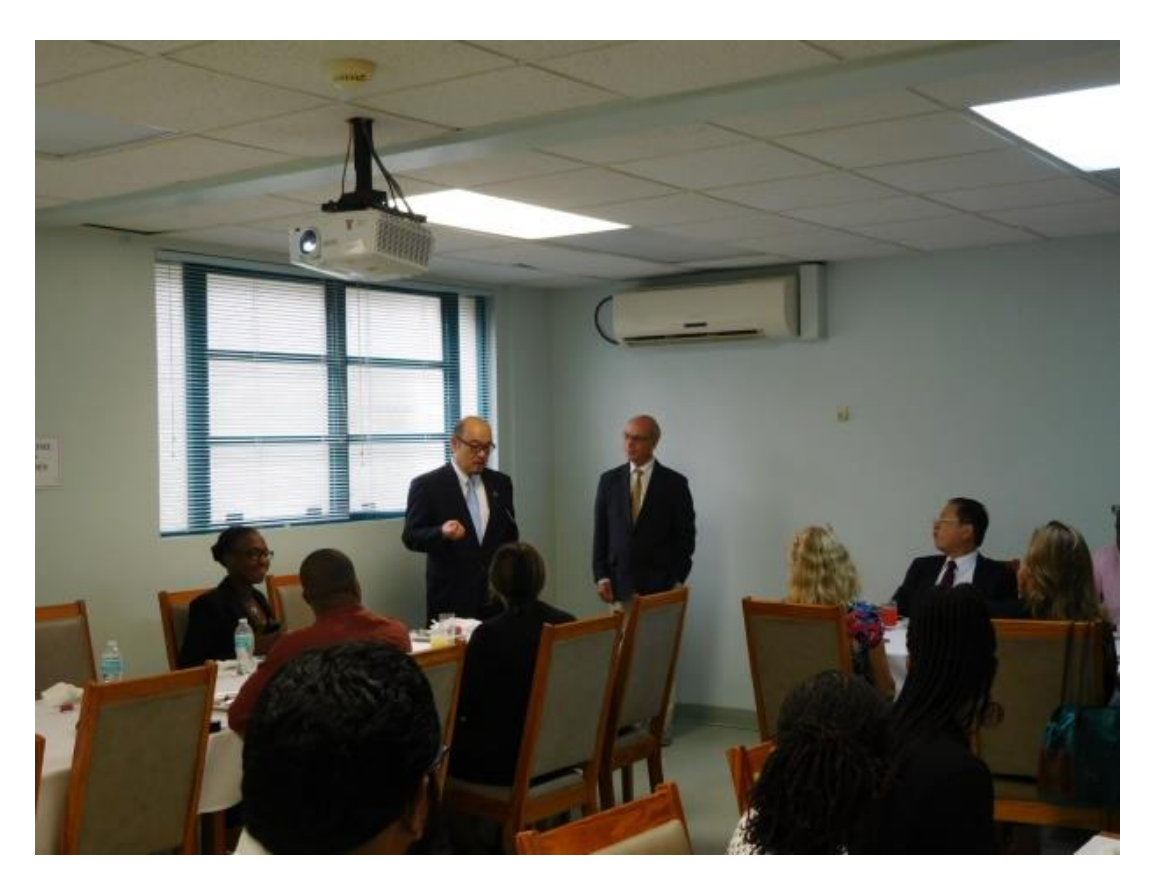
<sup>(5)</sup> Ambassador Shinada greets the audience during the lunch break

(4) Ambassador Shimanouchi gives a speech during the lunch break